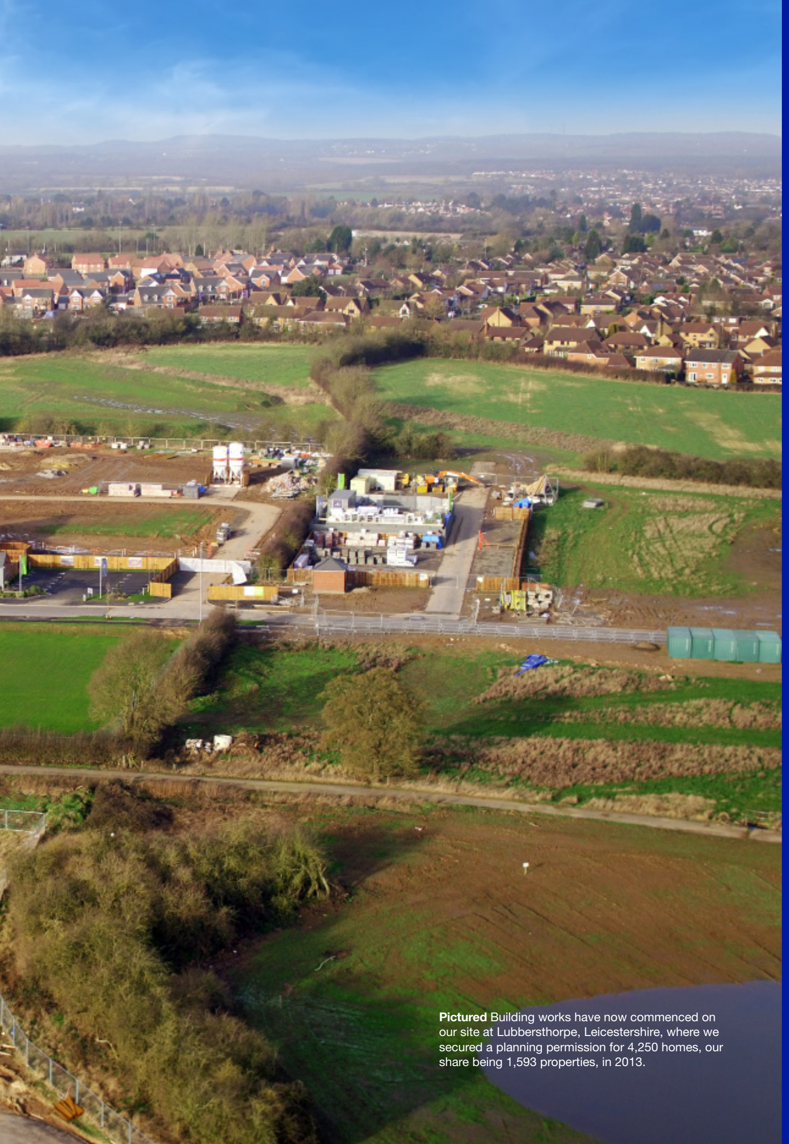
Pictured Building works have now commenced on our site at Lubbersthorpe, Leicestershire, where we secured a planning permission for 4,250 homes, our share being 1,593 properties, in 2013.